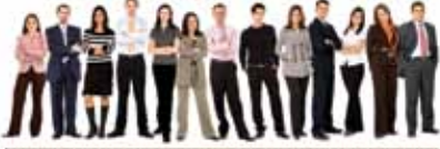
SHARING IDEAS. NETWORKING. SUPPORT. FRIENDSHIP. KNOWLEDGE.