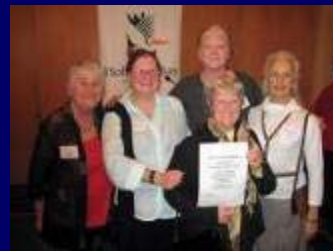
Local seniors networks