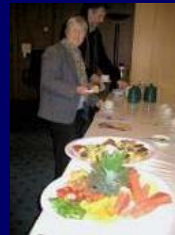
Catering for volunteer support functions